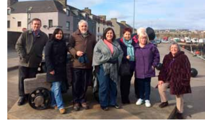
Resident Panel members meet a tenant group in Wick